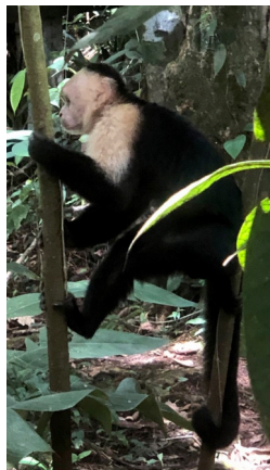
White-faced monkey (Capuchin)