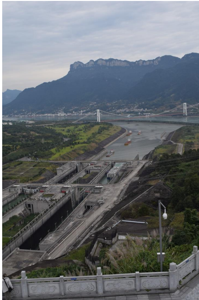
Three Gorges Dam

Twice we travelled by the very comfortable bullet train that can reach speeds of up to 350 km/hr. We passed through countryside of rolling hills and lush vegetation.