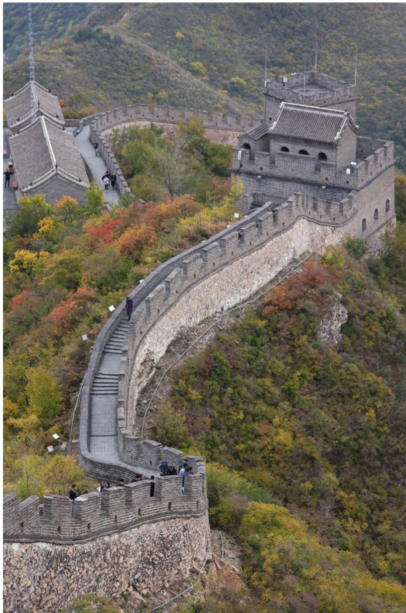
Section of the Great Wall

Twelve of our group were able to make the full trek along the Great Wall to the Twelfth Fortress where we were rewarded with a glorious view of the surrounding countryside.