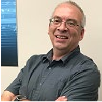
Gerrit Bos Website