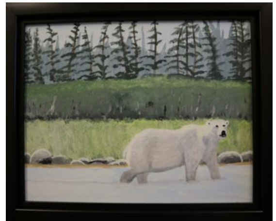
Churchill Polar Bear