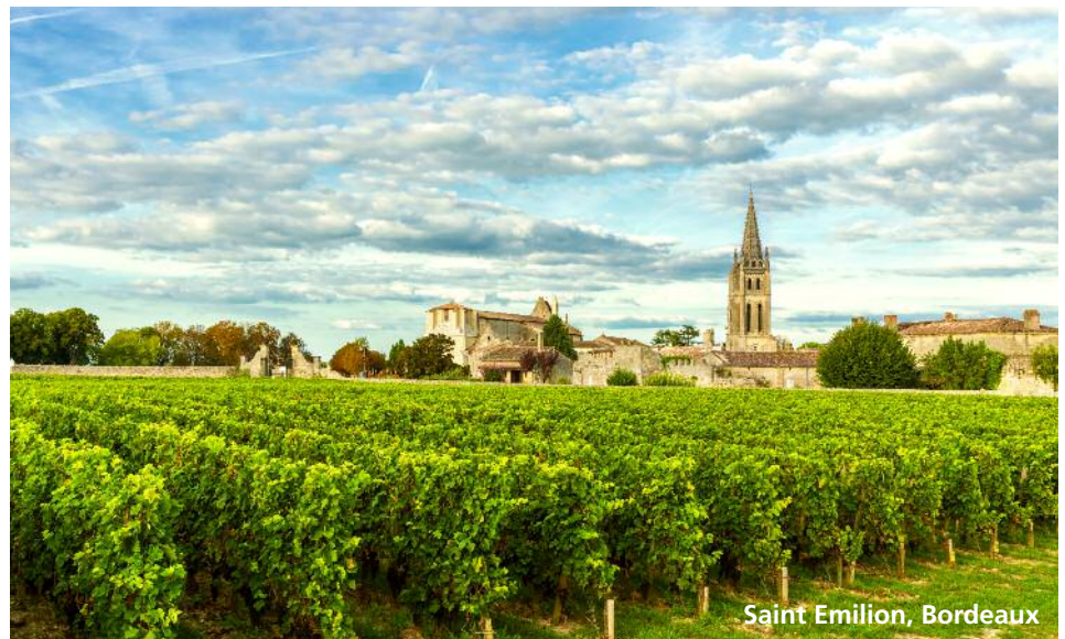
Saint Emilion, Bordeaux

Air Transat and Collette travel companies are partnering to offer university retirees, including UGRA members, a small group tour of the South of France in April 2020 at a discounted price. Brochures and other information will be available at the CURAC Conference at the University of Guelph May 22-24. For more information, go to https://gateway.gocollette.com/link/950308