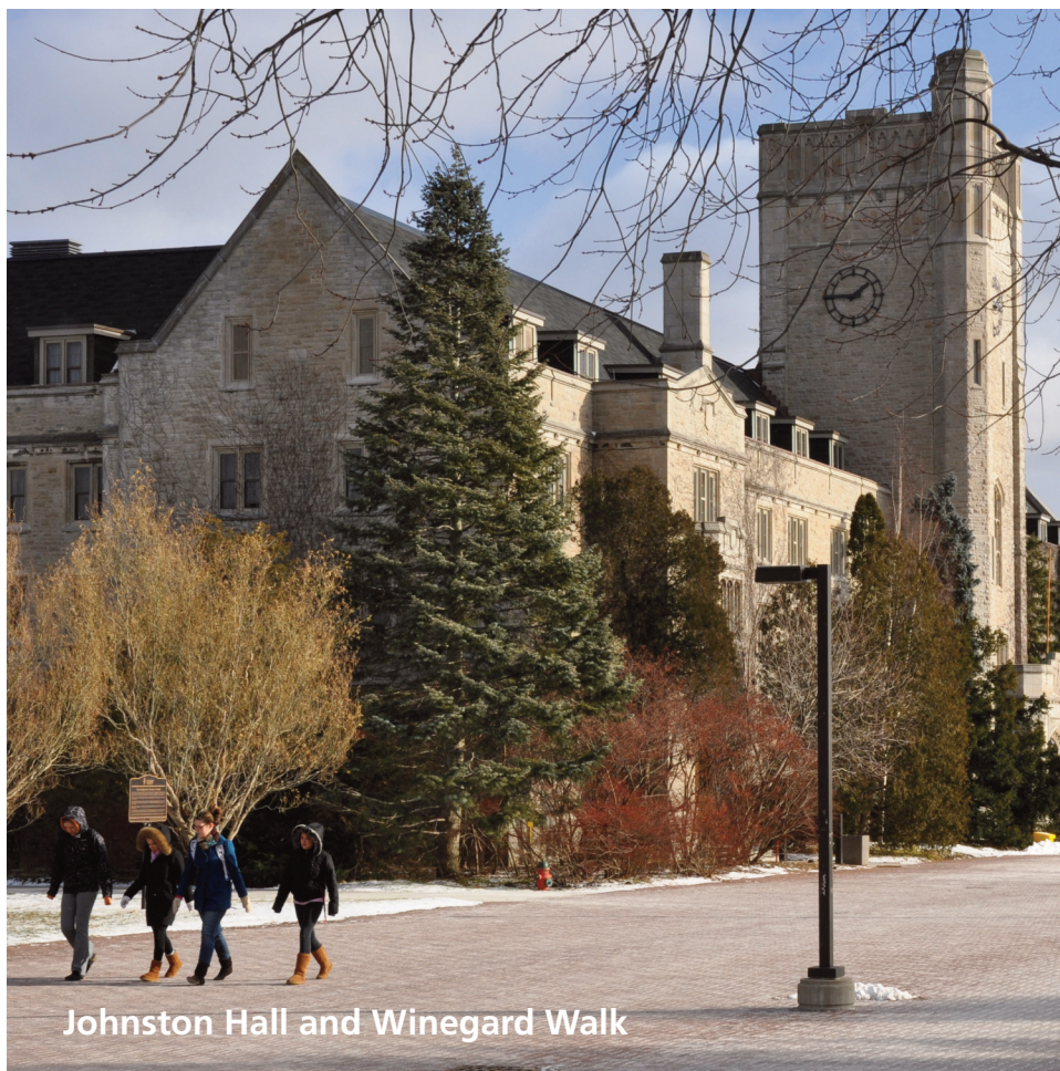
Johnston Hall and Winegard Walk