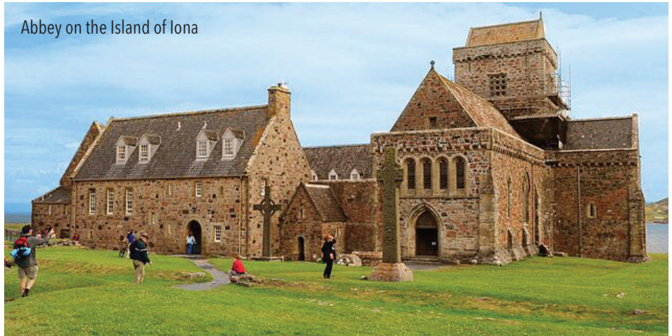
Abbey on the Island of Iona

Please visit our website for more details and information on how to take part in the program. Visit www.alumni.uoguelph.ca/travel or e-mail travel@uoguelph.ca if you have questions.